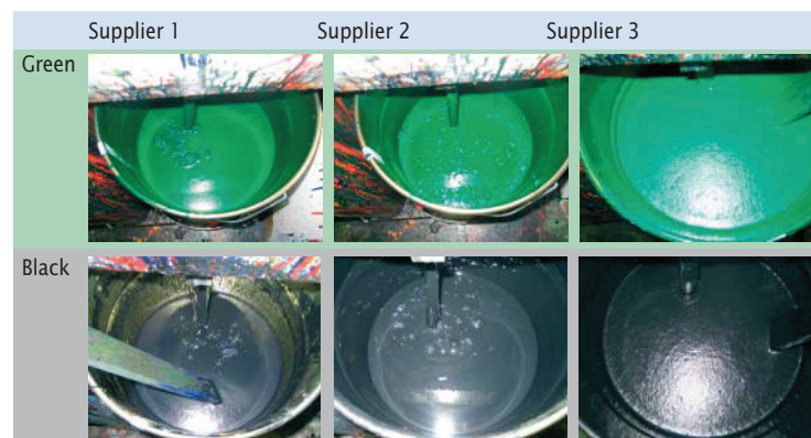
Figure 1: Colour variation during the test.

A good interaction between operators, ink supplier and the design of the ink metering system together with the setting of the positive measurable and achievable target colour consistency, helped to overcome the problems caused by foaming ink. It did not stop the ink from its ability and sometimes willingness to foam.